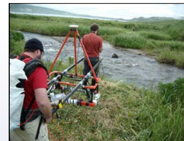
Geophysical Services Digital Geophysical Mapping (DGM), GPS Surveying, & GIS Mapping