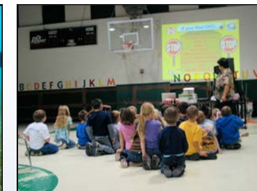
Community Education Public Involvement & Outreach Using the 3Rs Method; Recognize, Retreat, and Report