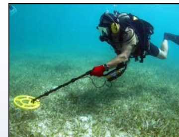
Underwater MEC Services UXO Dive Teams, Underwater DGM, Remotely Operated Vehicle (ROV)