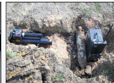
X-Ray Technology In-Field Munitions Identification Using Radiographic Film or Digital Inspection Systems