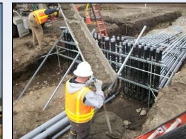
Construction Support Integrated MEC Services, MEC Avoidance for Cultural & Biological Surveys