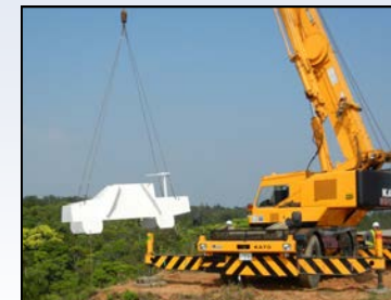
Operational Range Clearance/Maintenance Debris Removal, Range Maintenance, & Target Replacement