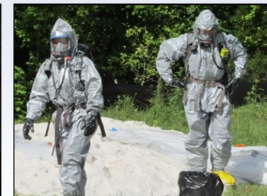
CWM Sampling and Removal In-field Chemical Warfare Materiel (CWM) Soil Sampling, Investigation, and Removal