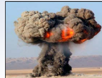
Munitions Response Services MEC Characterization, Remediation, & Disposal