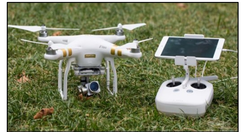
Unmanned Aerial Vehicle (UAV) and Controller