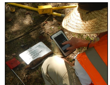
UXO Field Personnel entering data on a ruggedized tablet