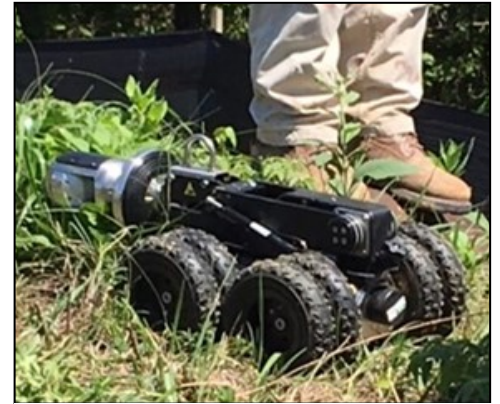
USAE's Pearpoint flexitrax 350 robot being prepared to visually inspect a section of 36" diameter pipe