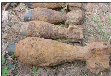
81mm & 60mm Mortars