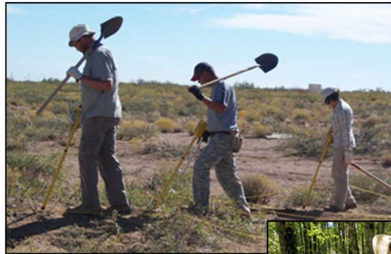
UXO Team with Analog Sensors Performing a Clearance