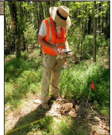
Field Personnel Entering Real-Time Data into Custom Data Forms on a Ruggedized Tablet