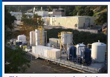
Tidewater operates and maintains a complex biological treatment system to remove perchlorate and chlorinated VOCs from groundwater at an NPL Site in California

Tidewater and USA Environmental formed a joint venture (Tidewater-USA JV) that merges Tidewater's environmental investigation and remediation capabilities with USA's MMRP capabilities. Our JV provides industry-leading experience and resources, having performed 24 IDIQ contracts for the Army totaling >$470 Million.