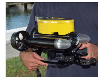
USA's ROV for Underwater Investigations and Mapping