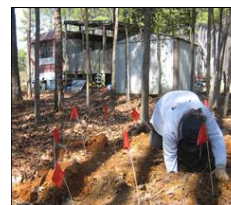
USA Investigating Anomalies, Camp Butner, NC