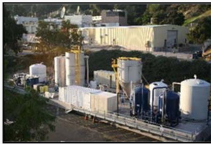
Tidewater operates and maintains a complex biological treatment system to remove perchlorate and chlorinated VOCs from groundwater at an NPL Site in California

Tidewater and USA Environmental formed a joint venture (Tidewater-USA JV) that merges Tidewater's environmental investigation and remediation capabilities with USA's MMRP capabilities. Our JV provides industry-leading experience and resources, having performed 24 IDIQ contracts for the Army totaling >$470 Million.